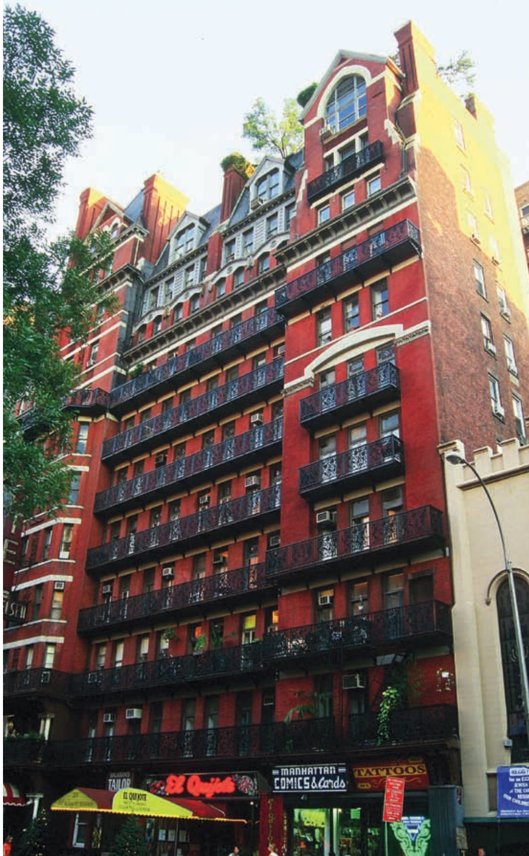
One of the neighborhood's most famous landmarks, The Chelsea Hotel

New York Sports Clubs , 270 Eighth Avenue & 128 Eighth Avenue