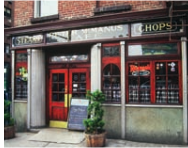
A revitalized Chelsea, which is experiencing yet another rebirth thanks to projects like the Chelsea Piers Sports and Recreation Complex, is still home to a plethora of classic, working class haunts.

B oldly stationed between West Midtown and the West Village is Chelsea, a neighborhood that has maintained a dynamic personality much like its London Thames-area name-