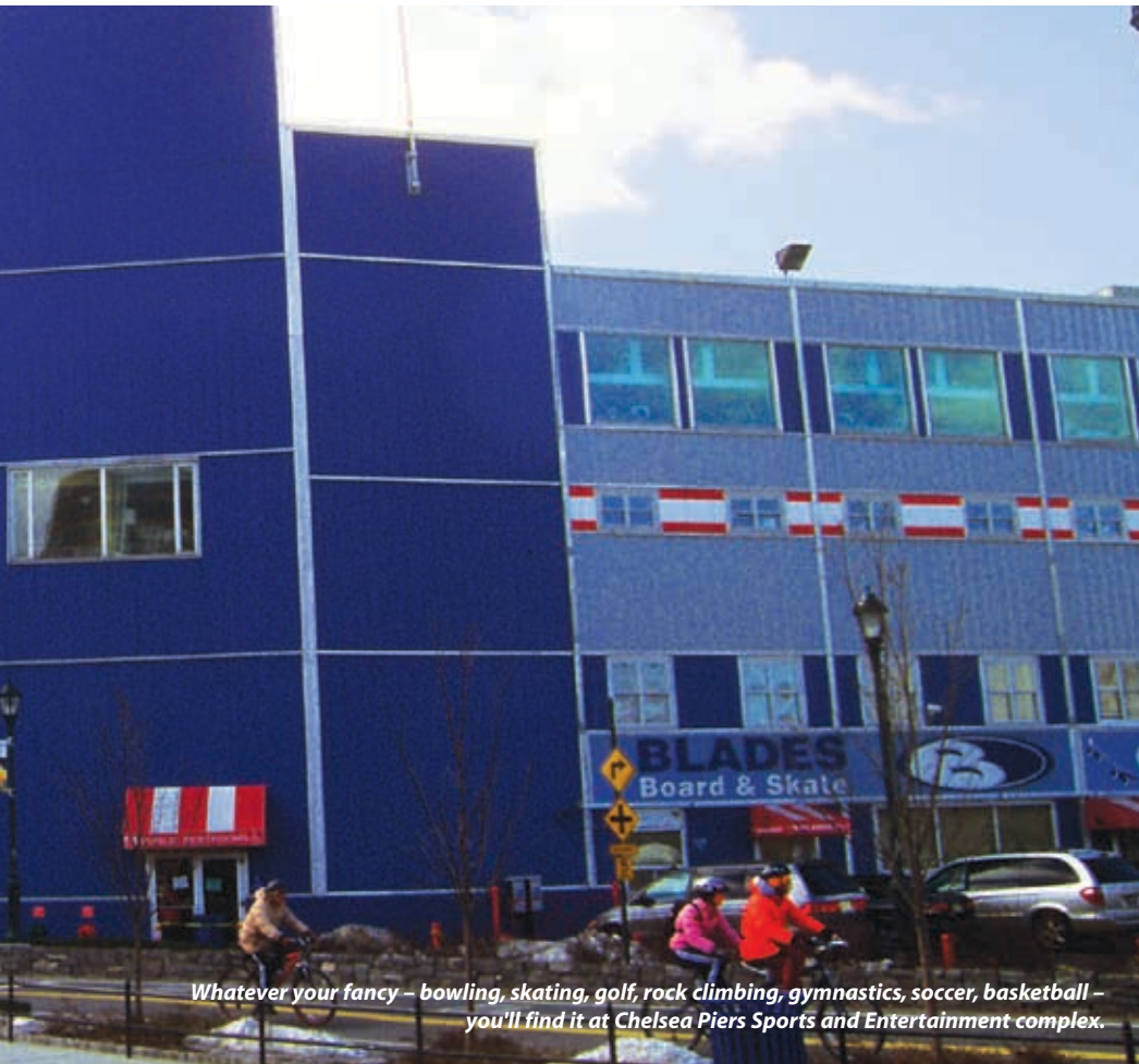
Whatever your fancy – bowling, skating, golf, rock climbing, gymnastics, soccer, basketball – you'll find it at Chelsea Piers Sports and Entertainment complex.

The company was awarded the rights to lease the Chelsea Piers and to create a sports and entertainment facility on the premises. Construction began on July 12, 1994.