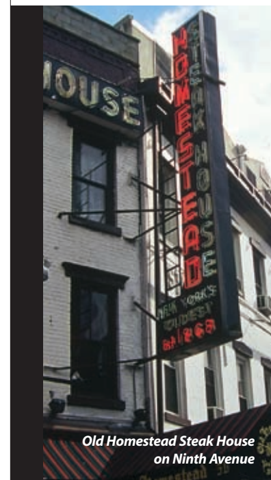
Old Homestead Steak House on Ninth Avenue

The Red Cat , 227 Tenth Avenue between 23rd & 24th Streets. Owned by chef Jimmy Bradley, it is a comfortable restaurant with a contemporary American menu. 212.242.1122