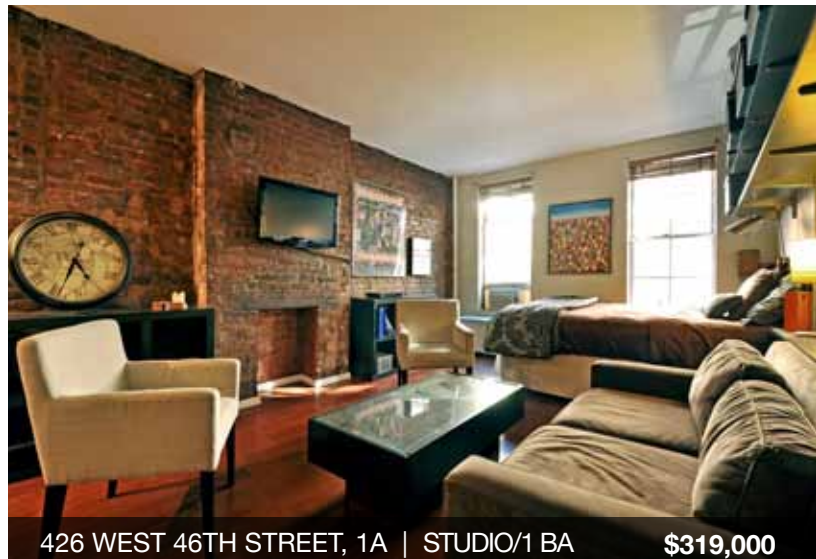
426 WEST 46TH STREET, 1A | STUDIO/1 BA $319,000

Captivating oversize studio featuring original exposed brick, deep rich cherry flooring and a decorative fireplace. This second floor unit has a newly renovated designer kitchen and plenty of storage. Situated on one of the most sought after streets in Clinton, the pristinely maintained co-op is steps from the fine restaurants on Ninth Avenue. The building also offers a favorable sublet policy. Investors welcome.