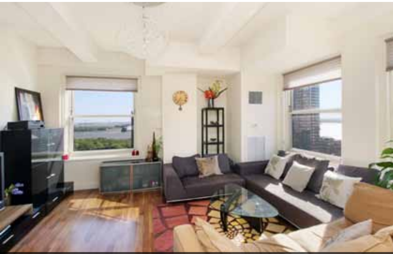
88 GREENWICH STREET, 1809 | 2BR/2BA $1,650,000

Rare chance to own a corner 2 bedroom apartment in Downtown's coveted 88 Greenwich Street condominium. Southwest exposures with beautiful park and water views. The windowed kitchen (complete with Sub Zero fridge, Viking cooking range), luxurious marble baths, king sized bedrooms, custom built-ins, washer/dryer has a generous floor plan make this a luxurious place to call home. This building features a state of the art (staffed) gym, unparalleled sky terrace with 360 degree views, billiard room, library, business center, on-site valet and concierge services.