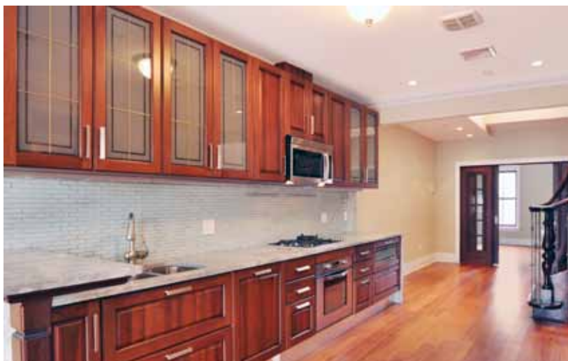
190 ST. MARKS AVENUE, PH | 3 BR/2.5 BA $1,399,000

This mansion in the sky has been custom-designed with impeccable attention to detail and top of the line finishes. The chef's kitchen is equipped w/ top-of-the-line appliances, rare slab Vermont white granite and Italian-made walnut cabinetry. The 2.5 spa baths feature rain showers, seamless glass doors, Italian Grazia tiles and walnut vanities. Handcrafted mahogany staircase, mahogany doors, Australian chestnut floors, oversized French windows and doors. The private roof deck offers impressive city views.