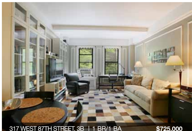
317 WEST 87TH STREET, 3B | 1 BR/1 BA $725,000

New to Market! Spacious Junior 4 ideally located on a quintessential Upper West Side block, steps from Riverside Park. This prewar co-op offers great details like 9.5' beamed ceilings, crown moldings and hardwood floors. Enjoy open southern and western views. Other notable features include a renovated kitchen, custom made wooden radiator covers and California Closets in the bedroom. This is a pet-friendly with a live-in super. Laundry and private storage in the basement.