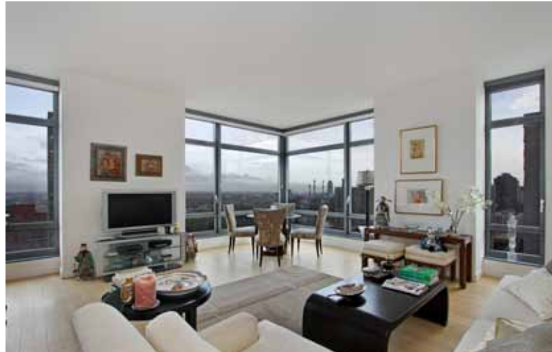
450 EAST 83RD STREET, 23C | 2 BR/2 BA $1,999,000

Truly spectacular corner condo in a prime location. This mint-condition, 2 bedroom, 2 bath apartment rests in on the 23rd floor of the Cielo condominium. The unit's floor-to-ceiling windows offer a panoramic view of Central Park and the city skyline. The eat-in kitchen features appliances by Wolf, Meile, and Sub-Zero, and both bedrooms feature walk-in closets and ensuite bathrooms. Building amenities include concierge services, laundry facilities, kids playroom, health club, a roof deck and on-site parking.