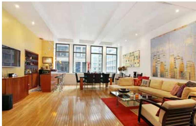
252 SEVENTH AVENUE, 7G | 2 BR/2 BA $2,450,000

Spectacular, bright north-facing oversized loft with a massive living room. Featuring hardwood floors, 11 ft beamed ceilings and custom-made Cabinetry. The open chef's kitchen with granite countertops has stainless steel appliances, pantry with washer and dryer hookups. The master bed includes a marble master bathroom with soaking tub and separate shower. Full time doorman/concierge, fully equipped gym, children's playroom, storage for every unit, valet, common roof terrace, garage, and Whole Foods directly downstairs.