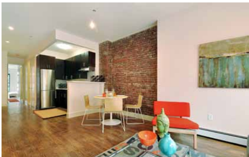
355A HALSEY STREET, 2 | 2 BR/2 BA $415,000

A chic, boutique brownstone that has been modernized while maintaining its original charm. The 893 sq ft condo features exposed brick walls, decorative arched windows and recessed lighting. Enjoy over 600 sq ft of outdoor space in private backyard. Other features include a kitchen adorned with stainless steel appliances, including a dishwasher, range hood, Ceasarstone countertops and breakfast bar. There is a washer/dryer hook-up in the apartment and a storage unit for purchase in the building.