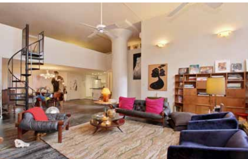
110 CLIFTON PLACE, 1E | LOFT/2 BA $669,000

Rarely available loft lover's dream in the famed Ping Pong building. Amazing 1,248 sq ft duplex apartment with soaring 14' ceilings. Get creative with the unique and flexible floor plan! East facing unit is flooded with sunlight. The apartment features treated oak strip flooring, architectural columns, open kitchen, private roof access and abundant closet and storage space.