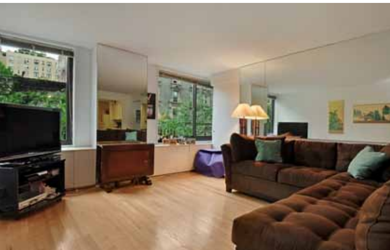
40 EAST 94TH STREET, 3A | 1BR/1BA $789,000

This highly sought after Condominium apartment has a wonderful feel. It is situated on the third floor overlooking tree tops. Exceptionally large windows in every room bring in amazing light, individually controlled heat and ac units throughout; large and airy living room, great size pass-thru kitchen with pantry. Hardwood floors, 5 large closets, and a spacious en suite bedroom complete this home. The full-service building features a 24 hour doorman, 3 elevators, roof top deck, and a wonderful Madison Avenue location.