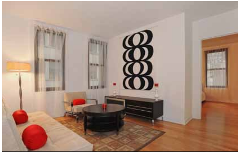
56 PINE STREET, 10E | STUDIO/1BA $410,000

This recently-converted condo-loft showcases the best of both worlds. All the modern condo-amenities such as billiards, wet bar, fitness center and cinema room are found here in this full service building. However, being home to fewer than 100 units, this building maintains a sense of exclusivity. This smartly designed studio features room for sleeping, dining and entertaining. Featuring wall-to-wall windows, and a sleek kitchen w/ cappuccino cabinetry, this spacious home is complete and only moments to virtually every train in the city!