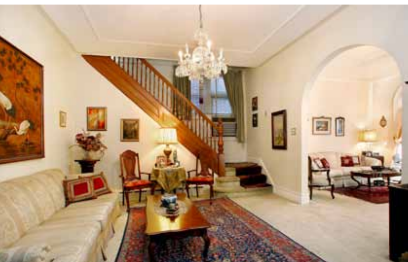
9422 RIDGE BOULEVARD | 5 BR/3.5 BA $1,849,000

Escape to a one-of-a-kind, majestic Bay Ridge mansion! This unique brick home boasts original detailing and exudes elegance. A grand foyer leads to a sitting room which opens into a sprawling formal salon. The spacious eat-in kitchen is windowed on 3 sides making for a bright and airy dining/cooking space. Ascend up a beautiful wooden staircase to the second floor with 4 lovely bedrooms, plenty of closet space, and spacious master bedroom with balcony. Fully finished basement and landscaped backyard.