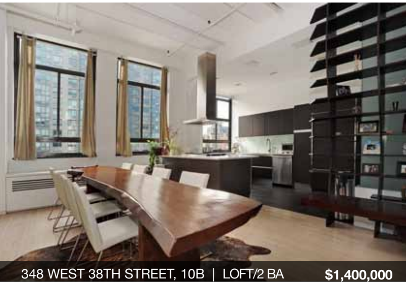
348 WEST 38TH STREET, 10B | LOFT/2 BA $1,400,000

This stunning apartment combines a classic loft with a high-end architect-designed renovation. The apartment boasts 12 ft ceilings, exposed brick, and massive southern facing windows. Enjoy a private balcony. Cook like a professional with a hood vented stove, vast granite counter space, the full complement of bold-faced named appliances, extra deep and wide sink and superb storage. The master bath has an oversized soaking tub set into the floor and a gorgeous extra-long sink. Low monthly charges.