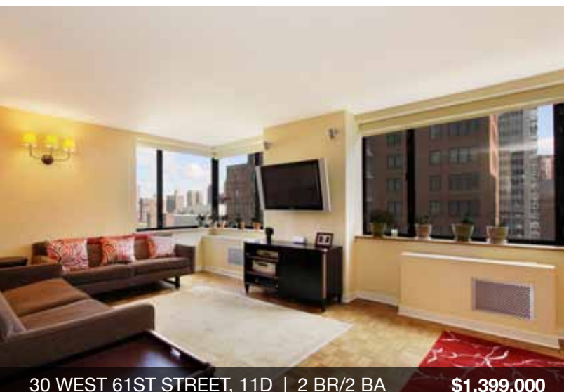
30 WEST 61ST STREET, 11D | 2 BR/2 BA $1,399,000

A stunning Upper West Side corner unit with exquisite renovations. The chef's kitchen features Sub Zero fridge and Hansgrohe fixtures. The master bedroom is decidedly upscale with a true California Closet masterpiece. Extensive enhancements in the master bath, including KWC fixtures as well as a Bossini shower head. The Beaumont Condominium is a 24/7 full service doorman building with concierge service, onsite storage, a separate bike storage room & roof terrace.