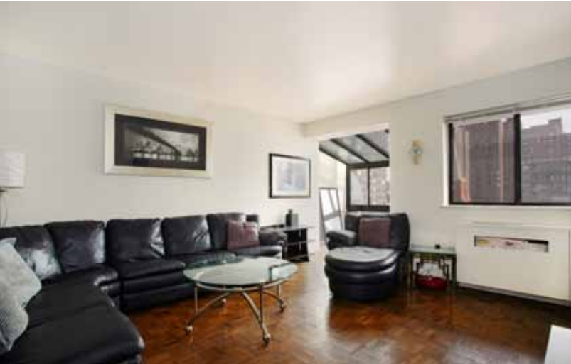
225 EAST 86TH STREET, 903 | 1 BR/1 BA $625,000

This loft-style 1 bedroom triplex condominium is located in the prime area of Upper East Side. This home has a spacious layout with charm. The unit also features a beautiful glassed Solarium which can be used as a dining room or office. The upper level features a king-sized bedroom with abundant closet space. The building features a 24 hr doorman, bike room and beautifully landscaped/furnished roof deck. Located just 2 blocks from the 4,5 and 6 trains and just steps from the future 2nd Ave subway.