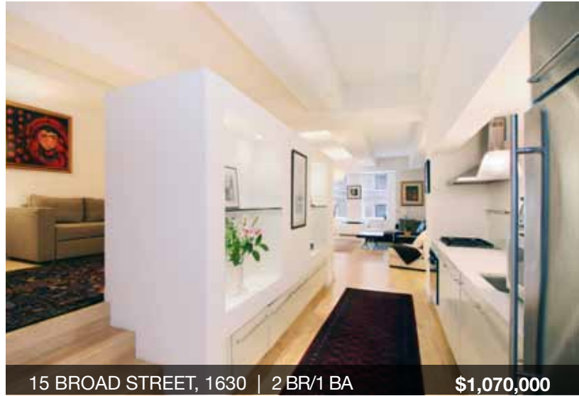
15 BROAD STREET, 1630 | 2 BR/1 BA $1,070,000

Fabulous 'Mansion in the Sky' with all interiors designed by world-renowned architect, Philippe Starck. This loft offers a voluminous interior, oversized windows, soaring beamed ceilings & light maple hardwood floors. The top-of-the-line stainless steel & granite gourmet kitchen. The luxurious marble bathroom, with Starck designed Toto & Hansgrohe fixtures, has a closet within that houses a Bosch washer/dryer. The building includes ultra-luxury services & amenities offered exclusively to its residents.