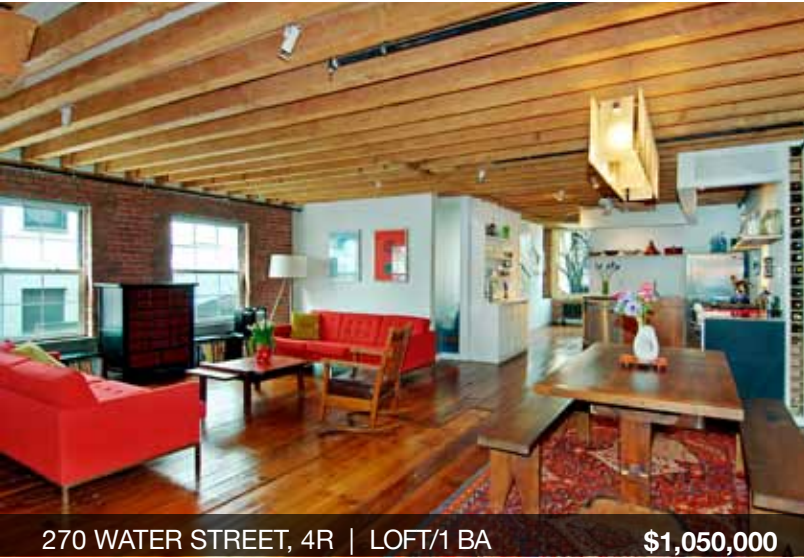
270 WATER STREET, 4R | LOFT/1 BA $1,050,000

Rarely available historic loft! Situated on one of the quietest cobblestone streets in the historic South Street Seaport stands this charming mid 19th-century co-op. This home features original hand-hewn timber columns, original beams, exposed brick and wide plank hardwood floors. Recently remodeled as a 1 bedroom plus home office (used as a child's room), the unit features treetop views to the west and south, and top-of-the-line appliances including a washer/dryer, Miele dishwasher, and Viking stove and microwave.